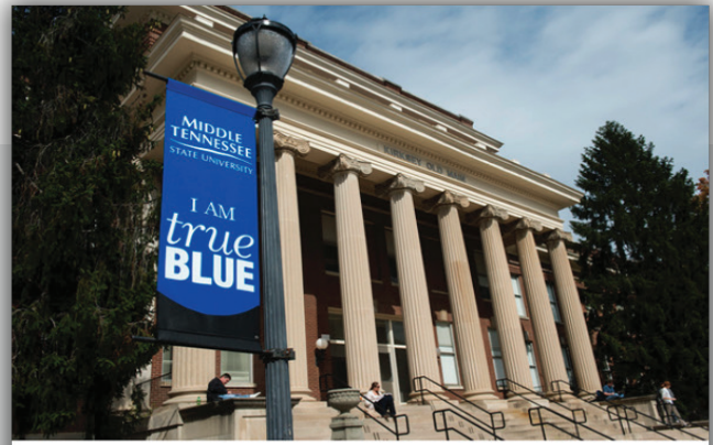
Photo Caption: MTSU's Kirksey Old Main, one of the original buildings constructed on the Blue Raider campus.